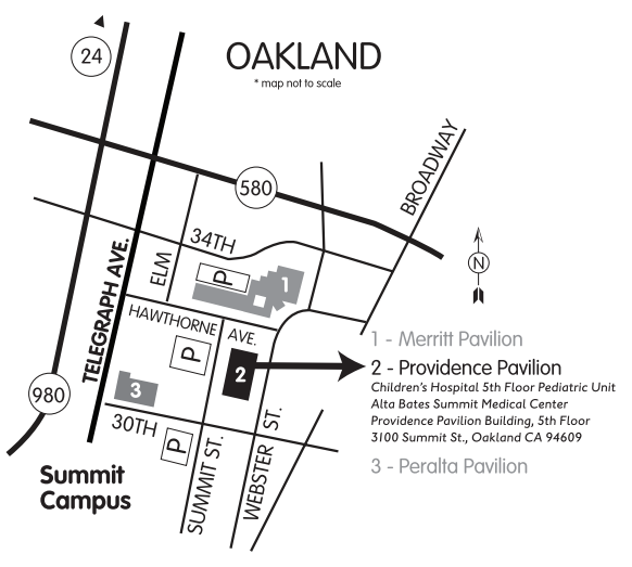
P - parking facilities